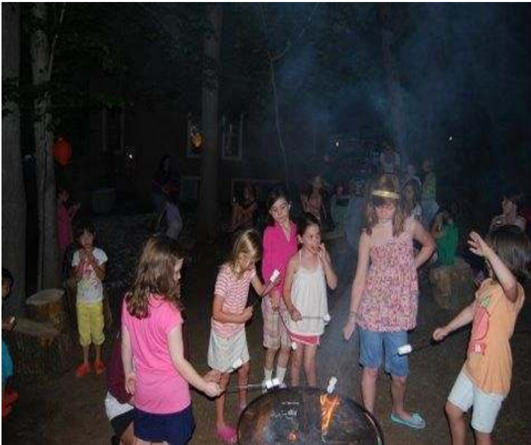
The First Grade Brownies enjoy an evening around the campfire.